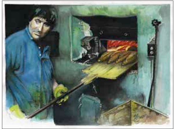
Zitos3, NY, NY, watercolor on cold-pressed watercolor paper, 12 x 16"