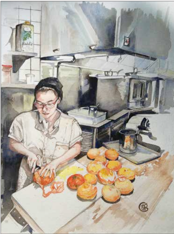
Squash Prep, Burlingame, CA, watercolor on cold-pressed watercolor paper, 16 x 12"