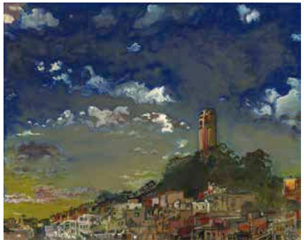
Coit Tower, San Francisco, CA, watercolor on art board, 8 x 10"